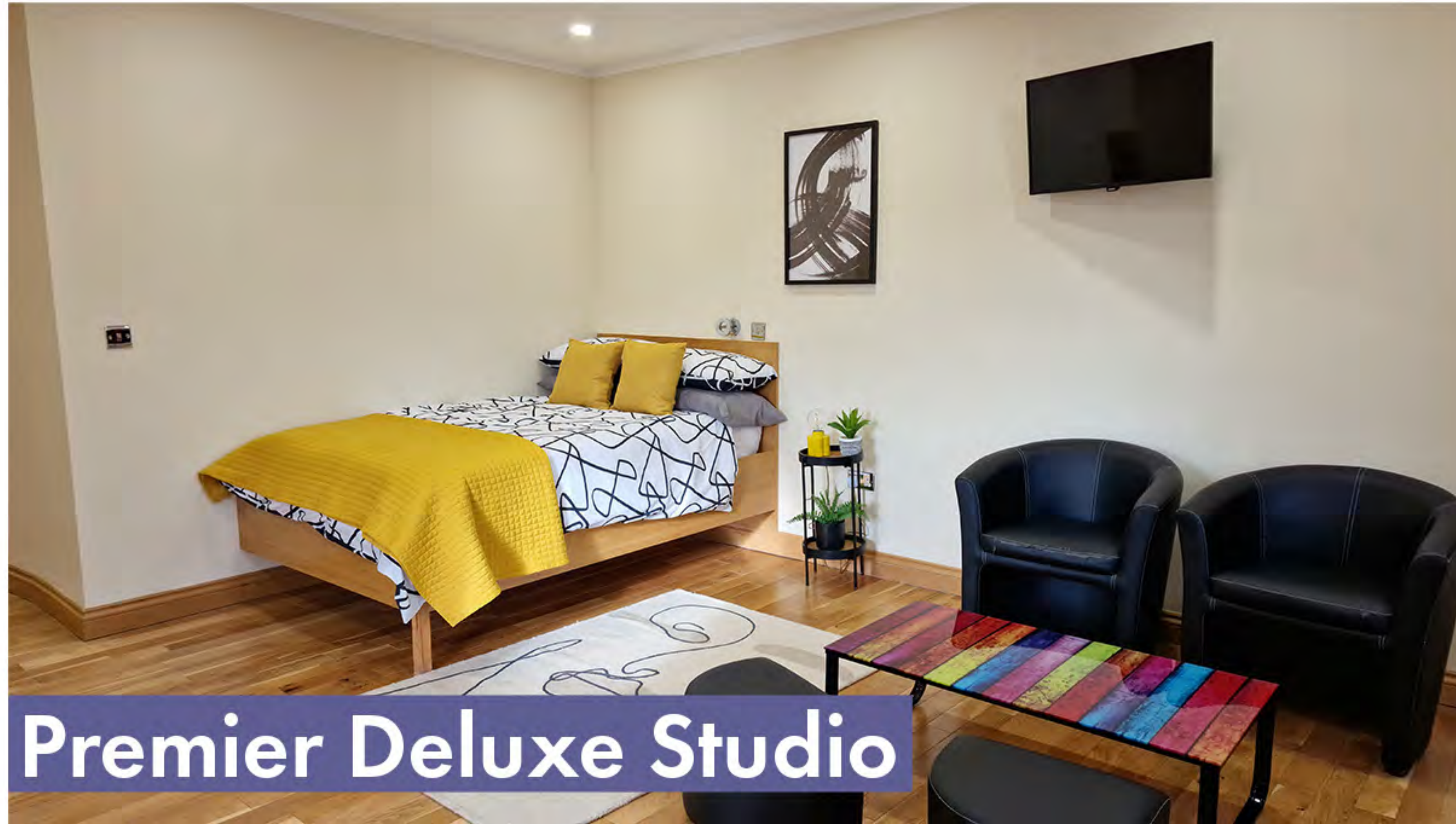
Premier Deluxe Studio